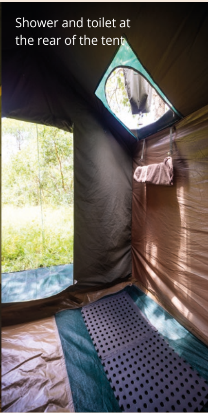
Shower and toilet at the rear of the tent